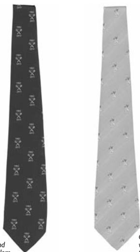
Dark Blue tie with yellow and red Club emblem